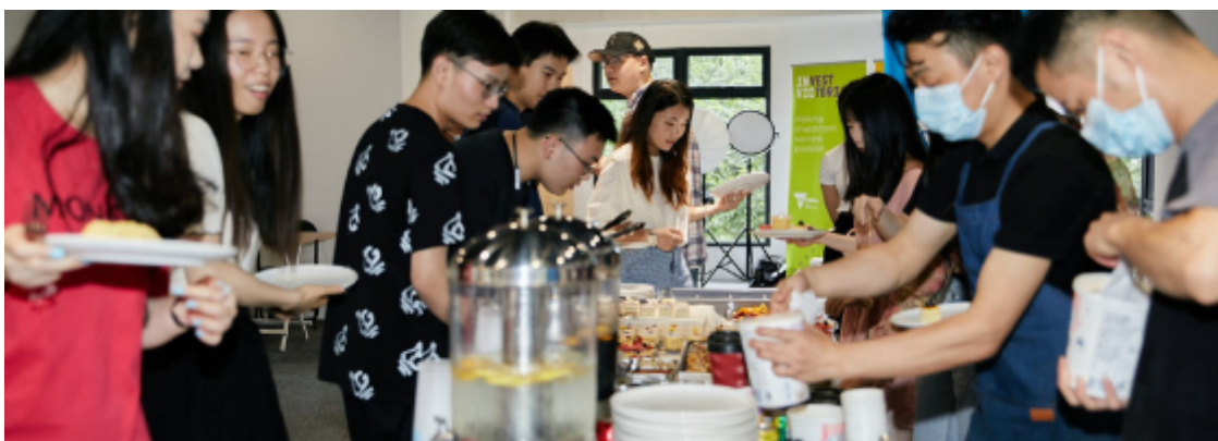
Study Melbourne Hub Shanghai event