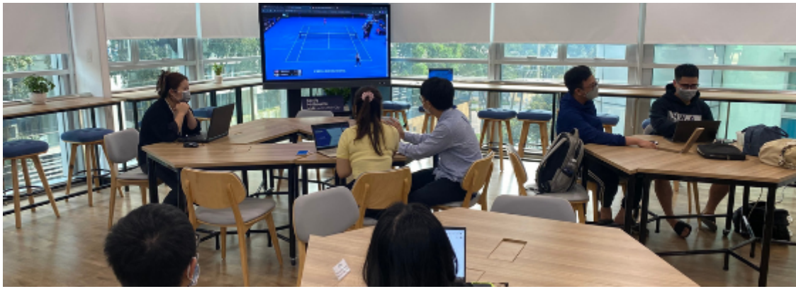
Students watching the Australian Open at the Hub.

The Study Melbourne Hub Shanghai welcomes students to invite their friends to join them at the Hub by creating their own personalised postcard and sharing it on WeChat.