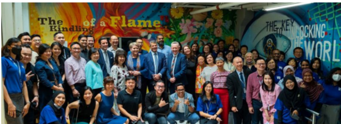
Image caption: VIPs, Victoria University staff, lecturers and alumni, and staff from the Victorian Government celebrating the unveiling of the Alumni and Knowledge Wall