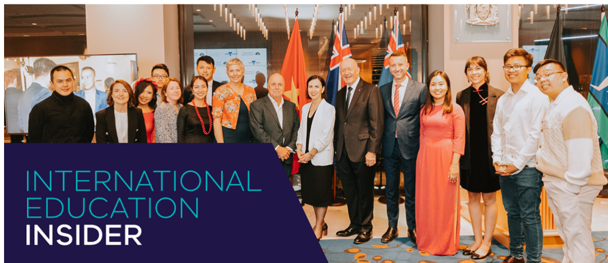
Caption: Strengthening Victoria-Vietnam people-to-people links at the Australia-Vietnam Leadership Dialogue Launch

Welcome to the April 2023 edition of the Study Melbourne International Education Insider.